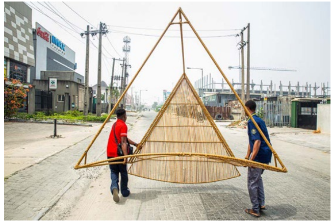
Nifemi Marcus-Bello, "Waf Kiosk (temporary installation)," 2022. Photograph. From the 2022 individual grant to Nifemi Marcus-Bello for "Africa—A Design Utopia"