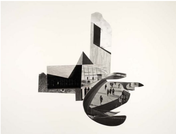
Marshall Brown, "The Principle of Inconsistency," 2019. Photo collage on paper, 17.5 x 23 in. Private collection, Chicago. From the 2022 individual grant to Marshall Brown for "The Architecture of Collage"