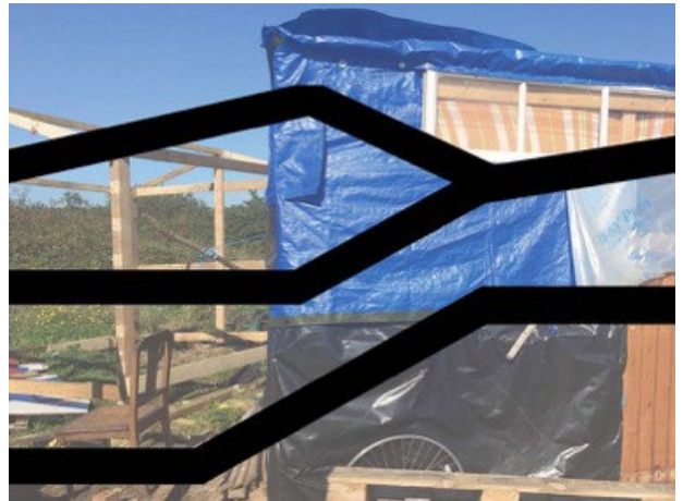
Coleman Collins "l'oblique ontologique deux," 2022. Digital collage with images from La Camp de la Lande (La Jungle in Calais), France. From the 2022 individual grant to Coleman Collins for "The (De)Ontological Oblique"